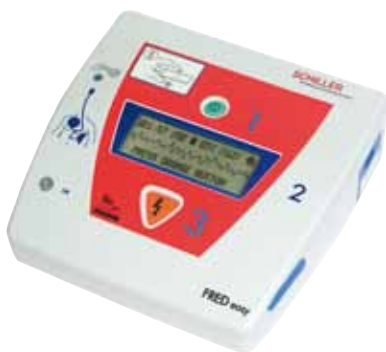
FRED easy with manual override