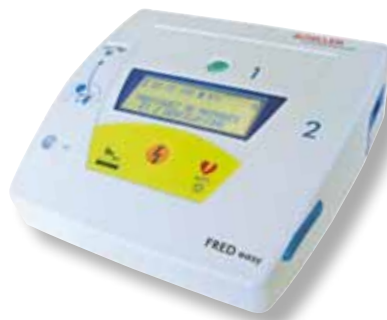
FRED easy fully automatic