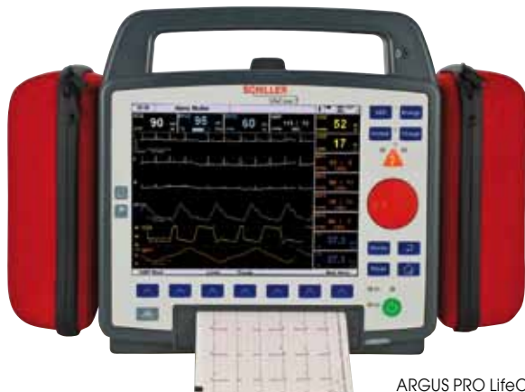
ARGUS PRO LifeCare 2

Schiller also offers ARGUS PRO LifeCare 2 and DG4000 to perform advanced patient resuscitation and monitoring.